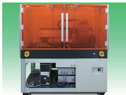
● Image of Cylinder JET