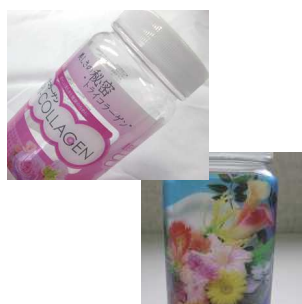
● Sample printed by Cylinder JET