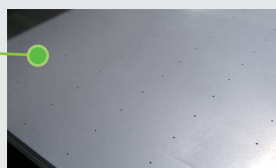
Air Vacuum(Vacuum Table)