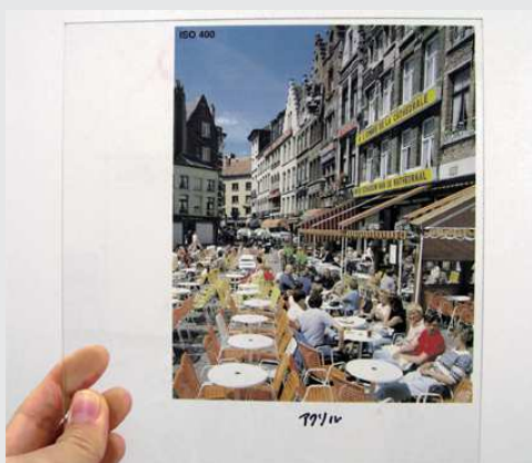
● Printing Sample : UV ink printed on resin plate

Our inkjet system "Stage-JET" is suitable for head/ink evaluation for printing system development. You could also innovate the system as the actual production equipment. Customize service is available on request.